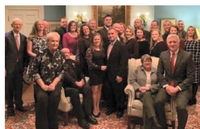
Sheriff's Department K9 Unit Officers and their Wives were special guests at GKC's Annual Awards Dinner.

When I moved to Greenville from Atlanta one of the first things I did was join the Greenville Kennel Club. For years before that I had come to the club's dog shows held at the old Greenville Auditorium downtown. I can still visualize the scene with judging held on the main level and downstairs in the basement. I have many fond memories of watching my father judge here over the years. He was on the panel for our 50th Anniversary show after we moved into Greenville's new Convention Center which has gone through several name changes over the years. I still have his marked judges catalog from judging here in 1962, the year I graduated from High School. As a member of the Greenville Kennel Club for the past 36 years, I am proud to write this tribute celebrating the past 80 years! Join me in the excitement of preserving the passion for future generations! ■