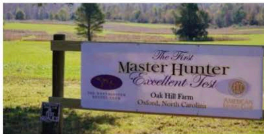
Wonderful weather - beautiful grounds