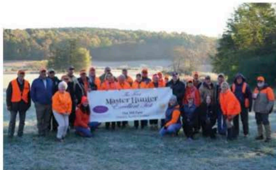
Gathering to celebrate the first MHX test

The MHX test will not work for every club, either because their grounds may not be adequate or the added testing level doesn't fit within a club's existing hunting test. However, with the flexibility that AKC is allowing clubs to host the MHX test, there will be enough MHX tests to keep the experienced dogs involved. AKC Master