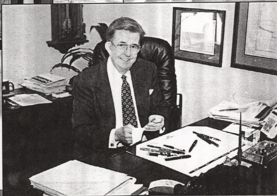
Sedgwick's Senior Vice President looks over a few of his antique fountain pens in his Little Rock office.