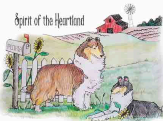
Collie Club of America National Specialty 2019

K udos to the Collie Club of America for discovering a city with all of the elements needed for a perfect Show-Sight. Peoria, Illinois has it all with its big city amenities yet small town hospitality!