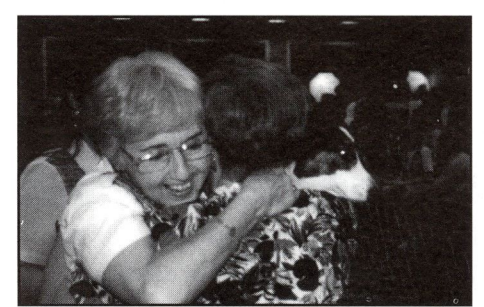
SHOWSIGHT MAGAZINE / JULY 1995

It's a Corgi for me, this dog has set me