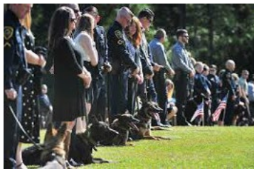
K-9 officers were among the mourners at the graveside service.