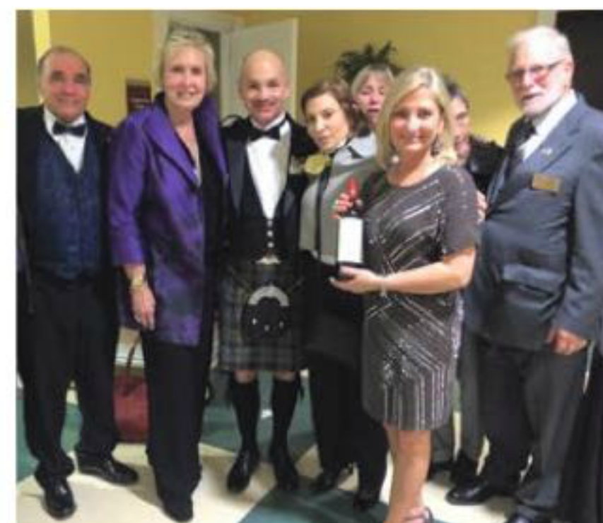
Preview of May Issue: Collie Club of America/ Take the Lead on Millionaires Row